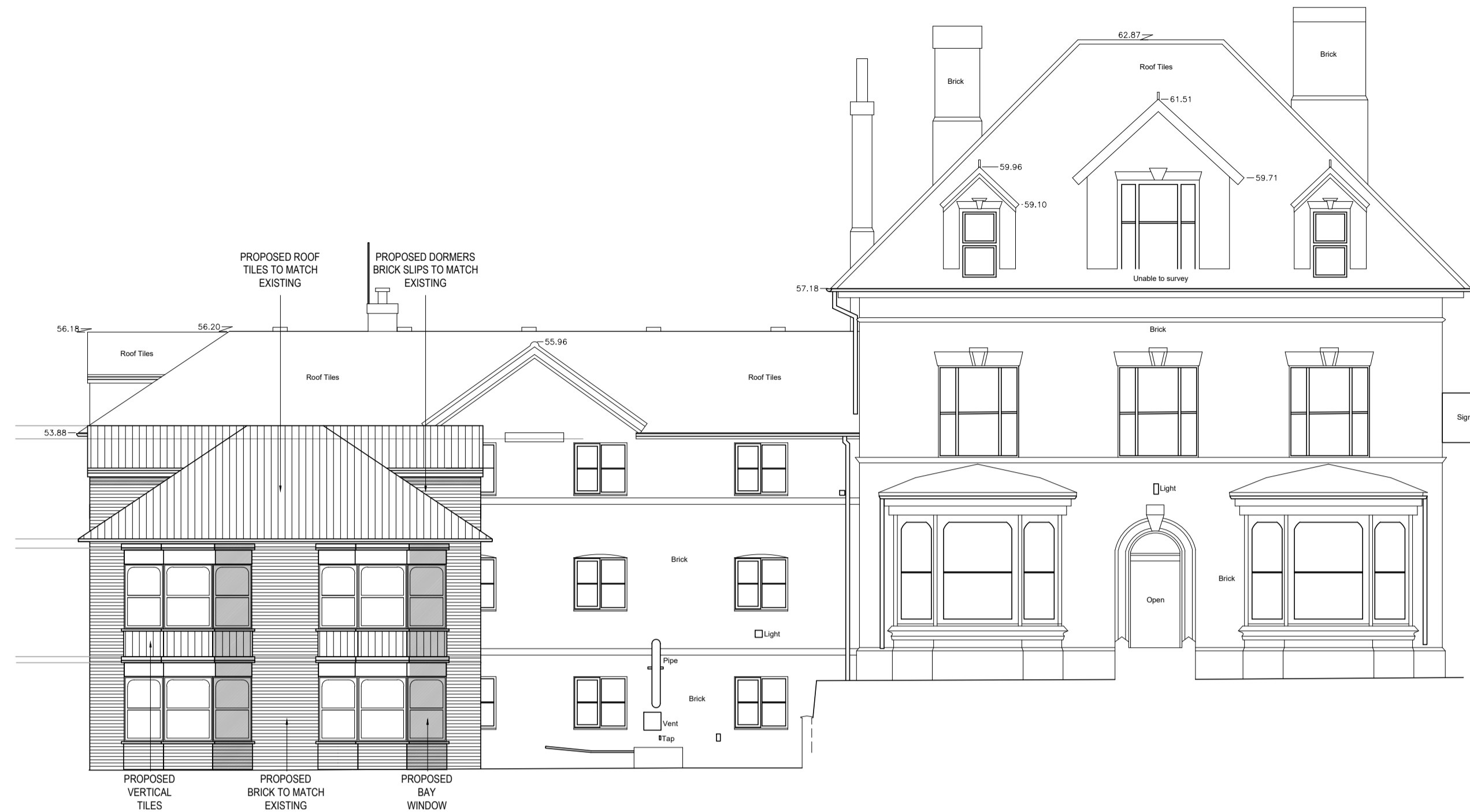
PROPOSED SIDE ELEVATION SCALE 1/100