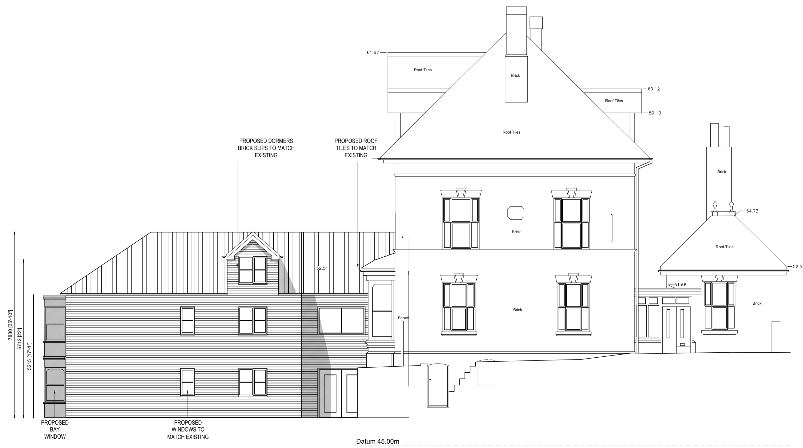
PROPOSED FRONT ELEVATION (HIGHWAY FACING) SCALE 1/100